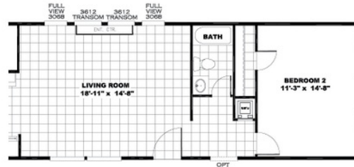
2 BEDROOM OPT.